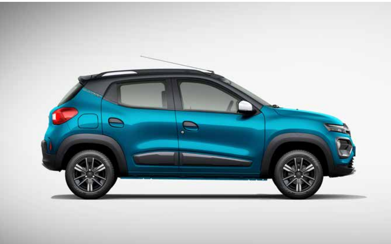
zanskar blue new