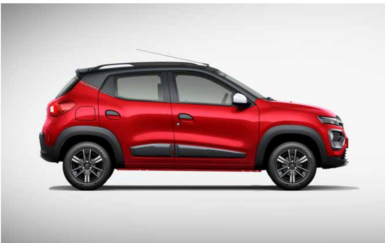
fiery red new