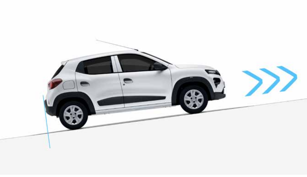
hill start assist 1 Maintains brake pressure for two seconds, preventing rollback when you move away on a steep slope.