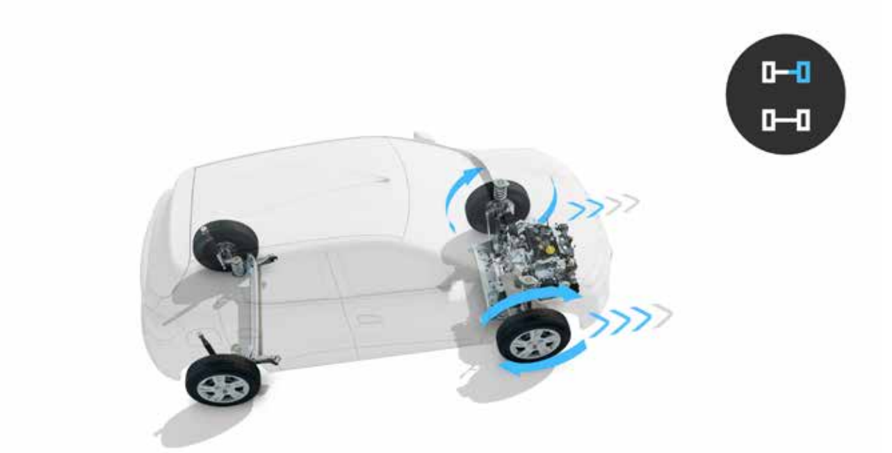
traction control system Limits wheel slip during starting, acceleration and braking.