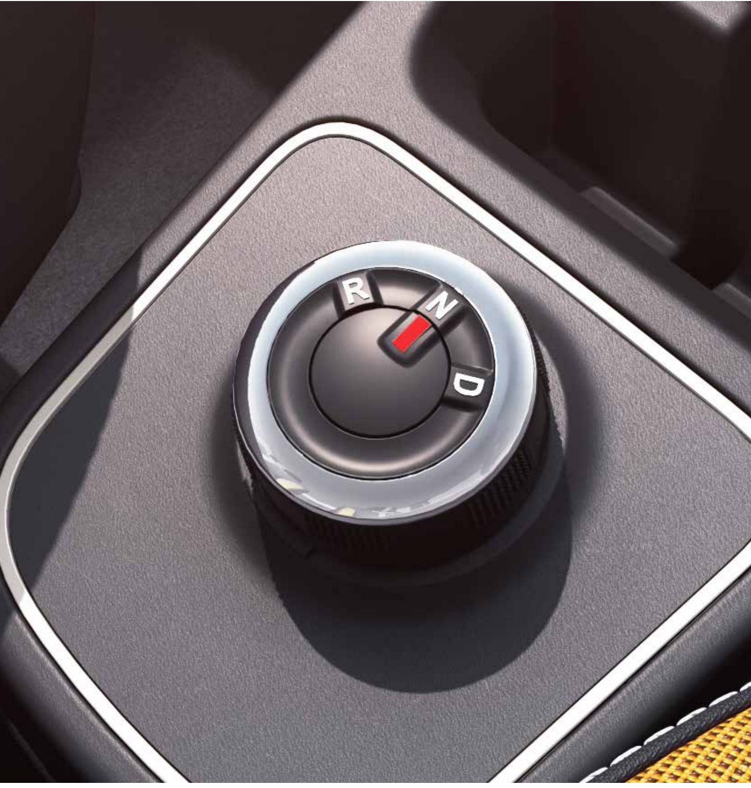
floor console mounted AMT dial