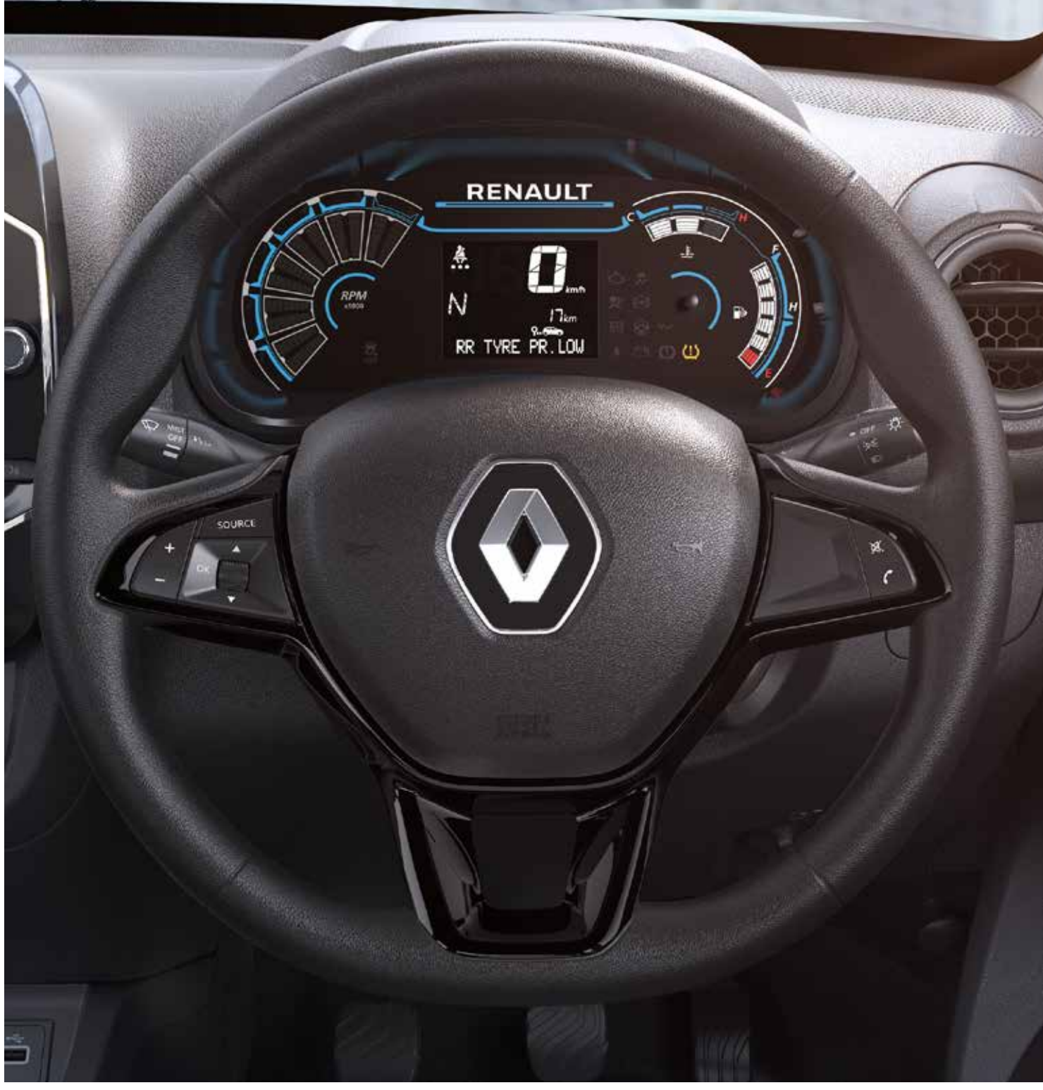
steering mounted audio controls