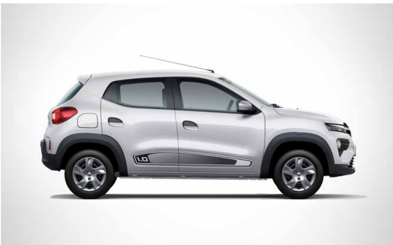
ice cool white