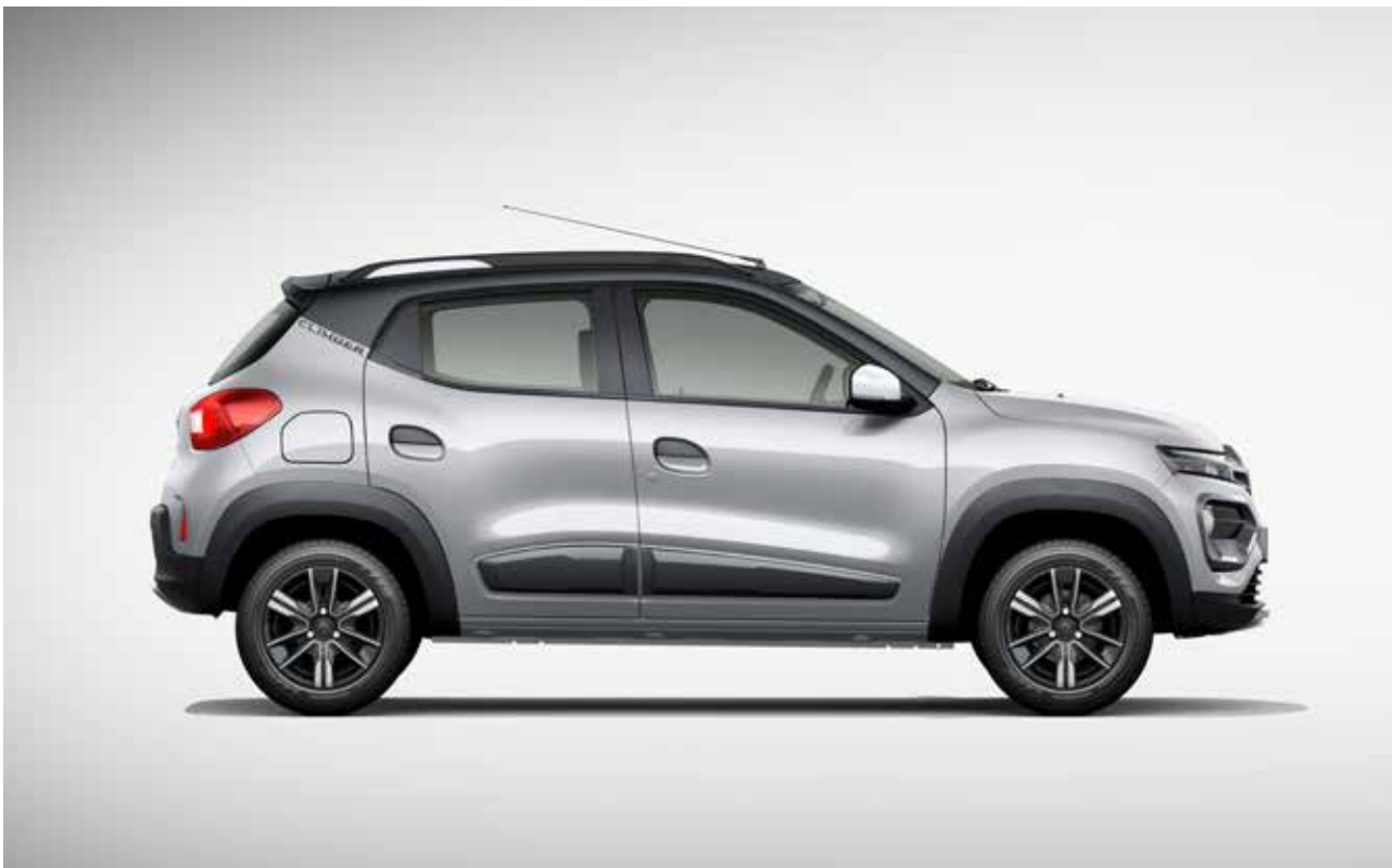
moonlight silver new