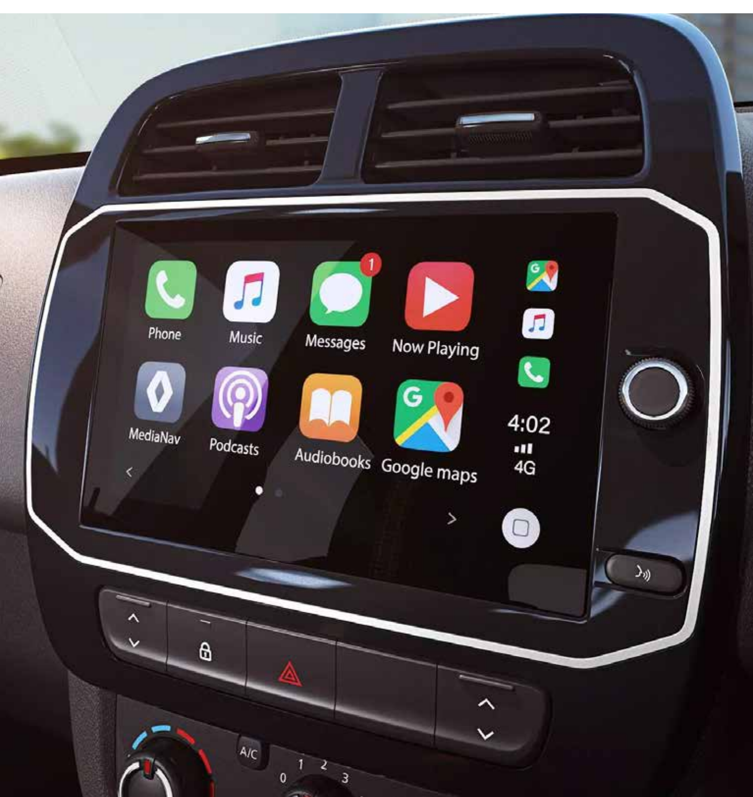
20.32 cm touchscreen mediaNAV