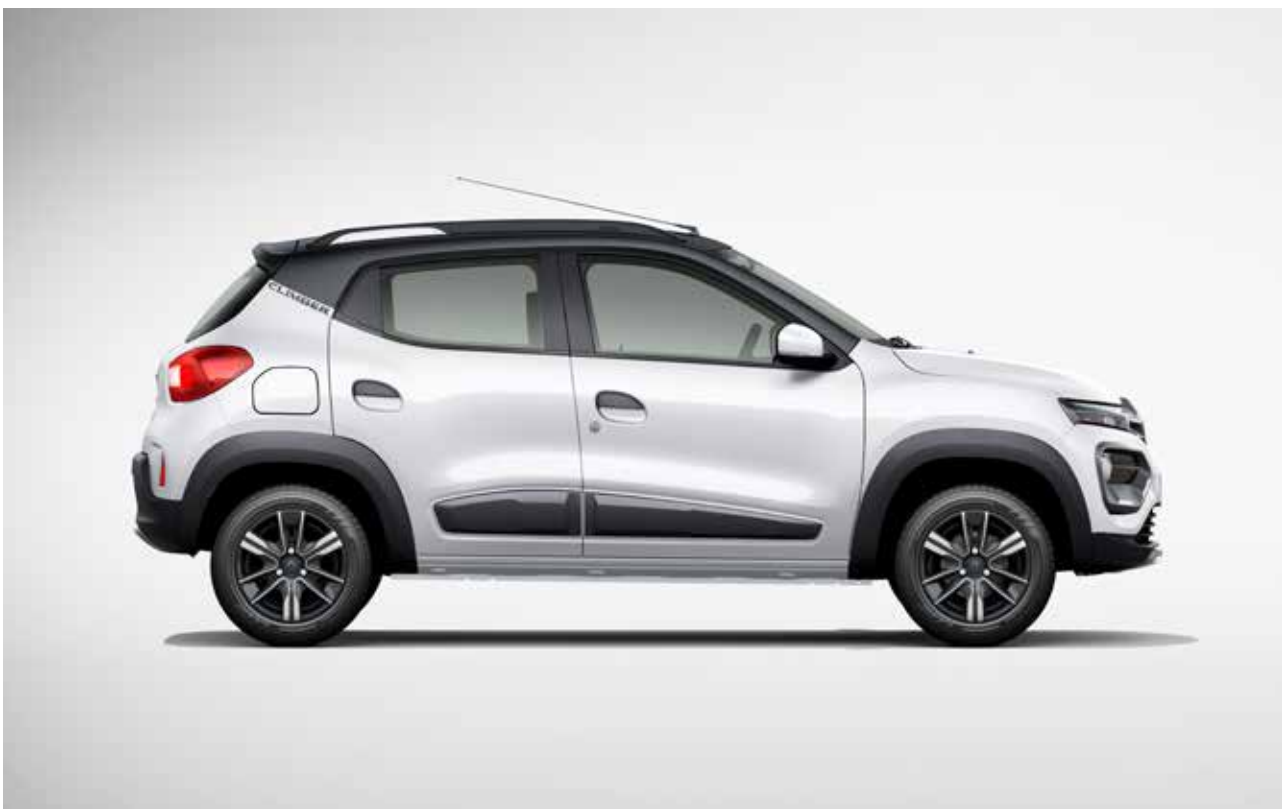
ice cool white