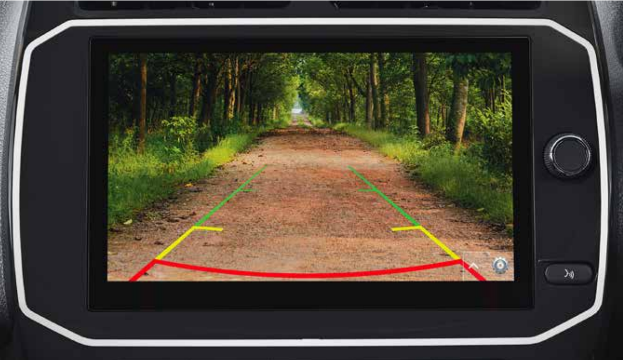
reverse parking camera with guidelines 3 Enhances parking precision in tight spots by providing visual assistance.