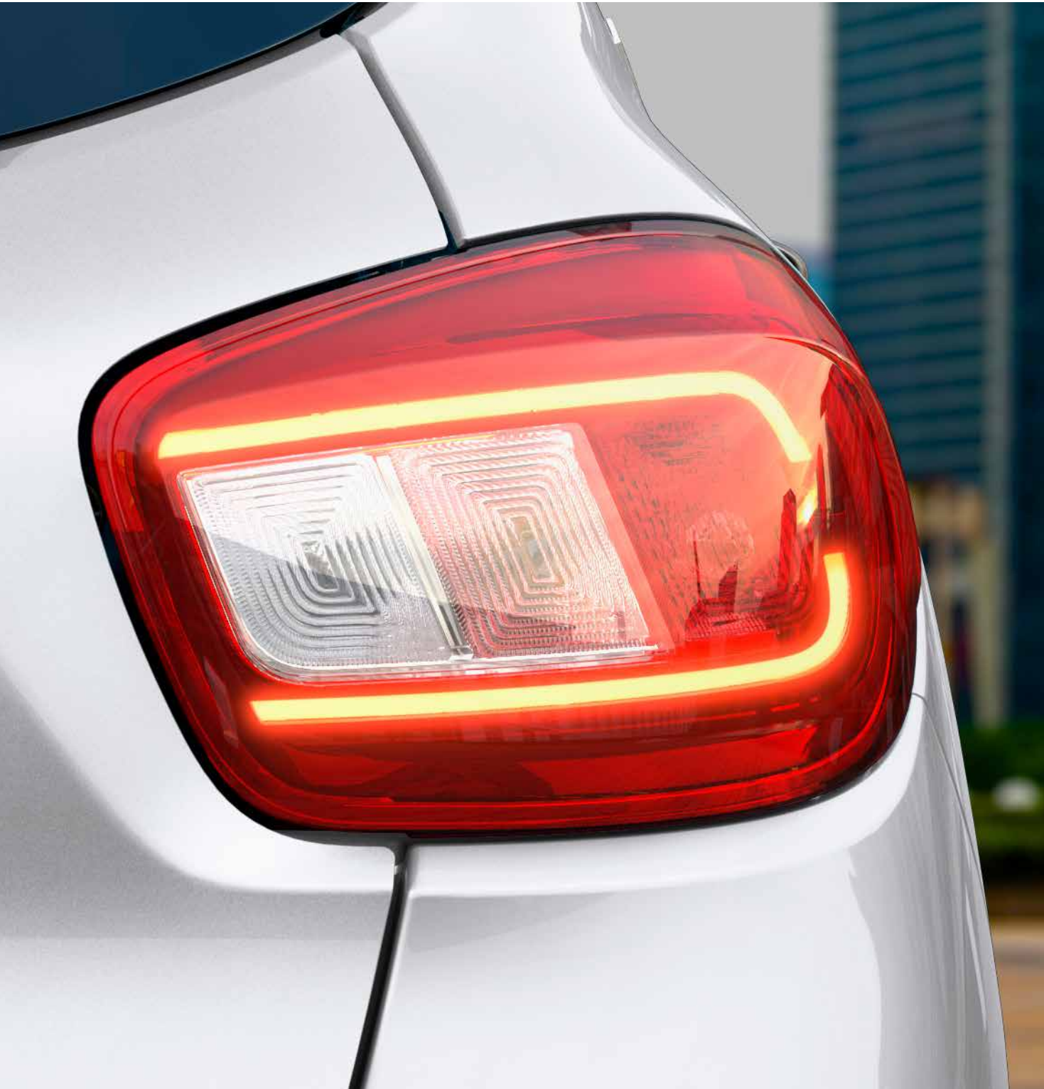
LED tail lamps with LED light guides