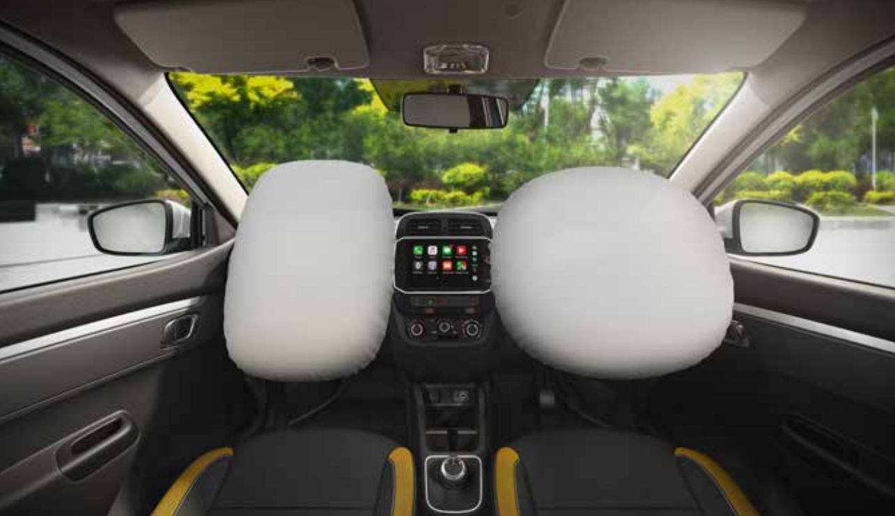
dual airbags Provide crucial protection by minimising the impact of collision.