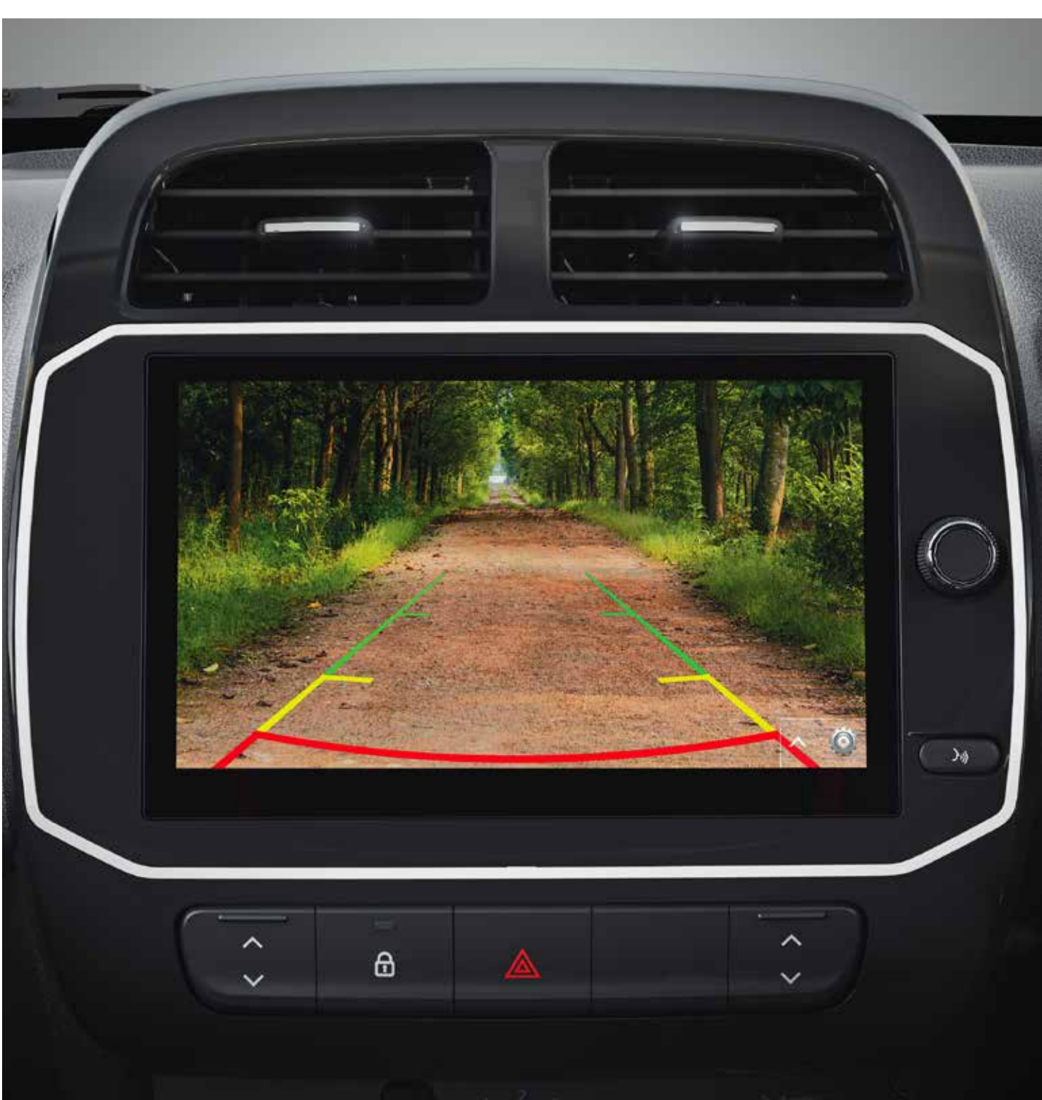
reverse parking camera with guidelines 4