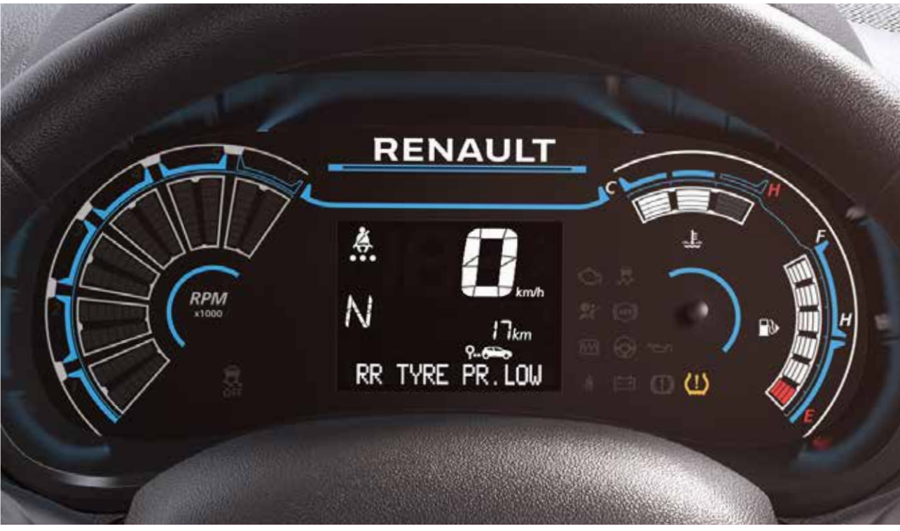
tyre pressure monitoring system Displays the tyre pressure status in real-time.