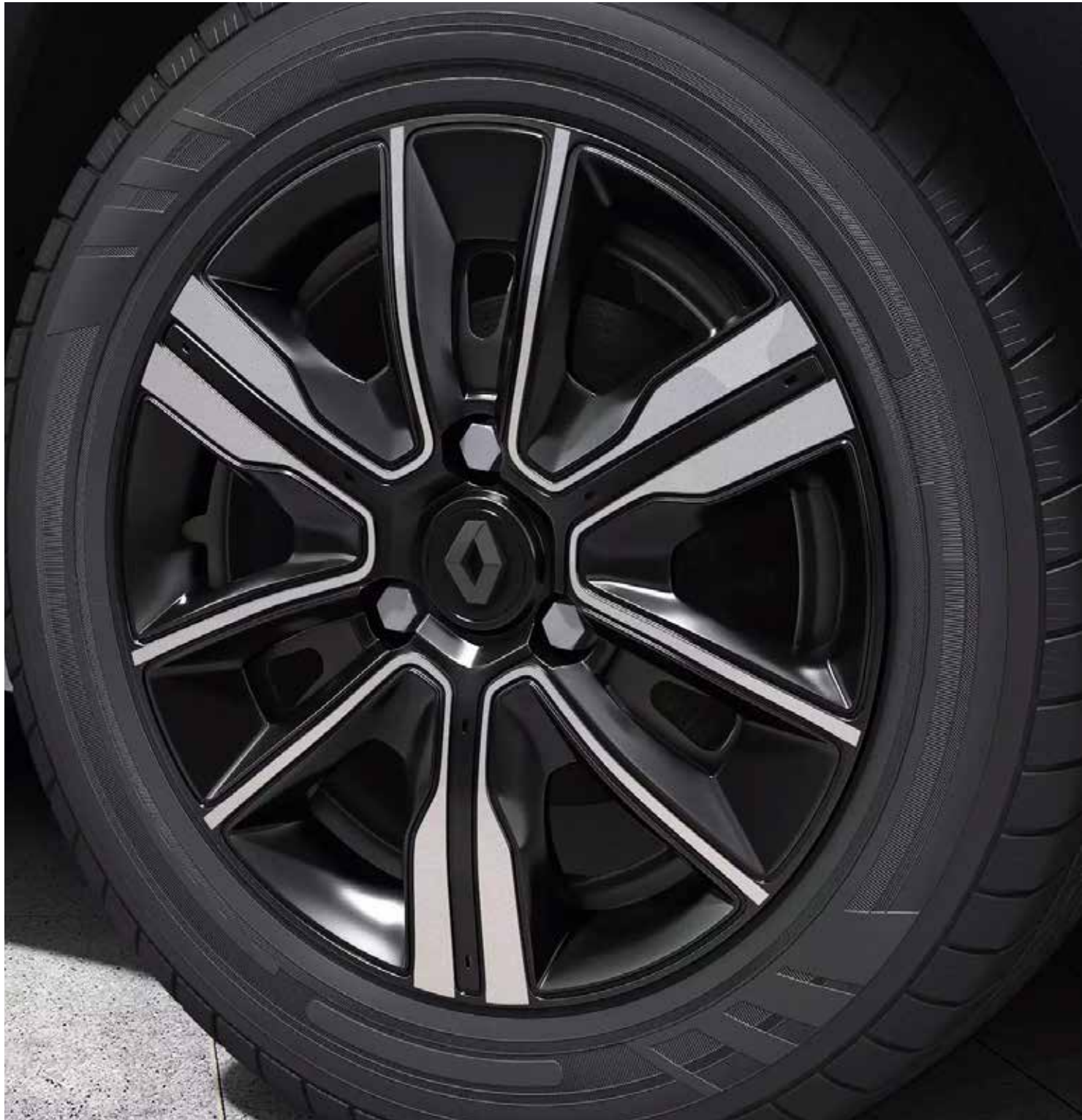
dual tone multi-spoke flex wheels