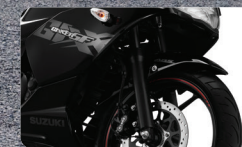
STIFFER FRONT SUSPENSION