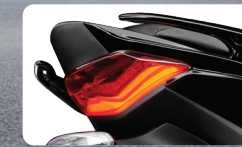
LED TAIL LAMP