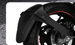
REAR TYRE HUGGER