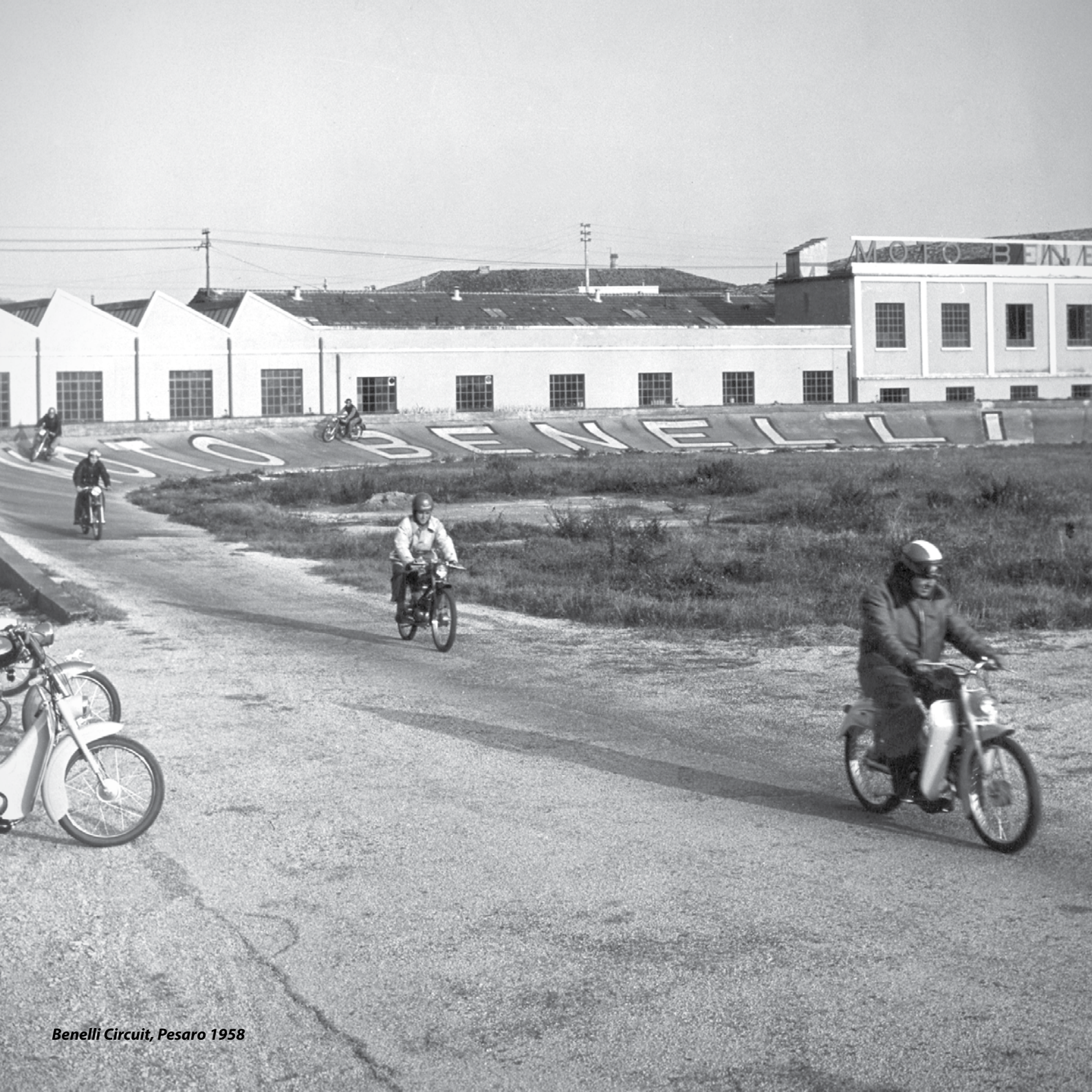
Benelli Circuit, Pesaro 1958