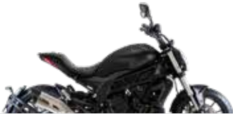
MATT BLACK METALLIC